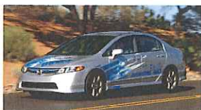
2010 Natural Gas Vehicle Display!!