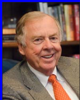
T. Boone Pickens